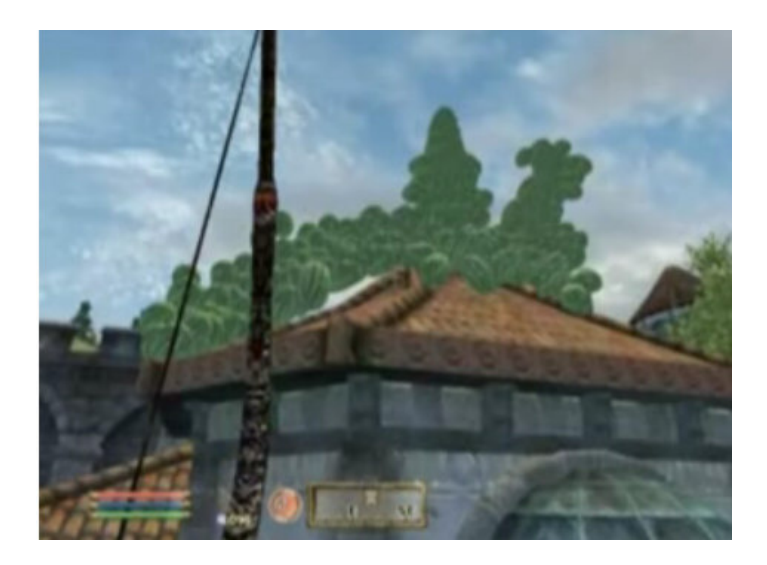
Figure 1: Melons falling from the sky in Oblivion

On the contrary, a bug immediately strikes the player, as it is an evident flaw in the game's system. For instance, in the role-playing game Oblivion (Bethesda Softworks, 2006), through a bug the player has the possibility to shoot from her bow myriads of watermelons instead of normal arrows. The player can do this by first bending the bow, thereupon choosing a watermelon from her inventory, and then shoot the watermelon into the air. Subsequently many watermelons will appear and one by one fall from the point at which the bow was directed (see figure 1). It is clear that this was not meant to be possible, as, even though the game has a fantasy theme, it does not make sense within the game world. Moreover, when an NPC happens to walk by, she does not take notice of the hundreds of melons falling from the sky.<sup>43</sup> In this case, the rule-based system behind the game manifests itself, and it becomes clear that the system determines what happens, even though the rendered events might not make sense in any way. When a player encounters a suchlike phenomenon, the representation and simulation components of a computer game, which normally blend together, are separated. In this sense, a bug is an element that can be considered as part of the separation of the elements that Brecht encouraged.