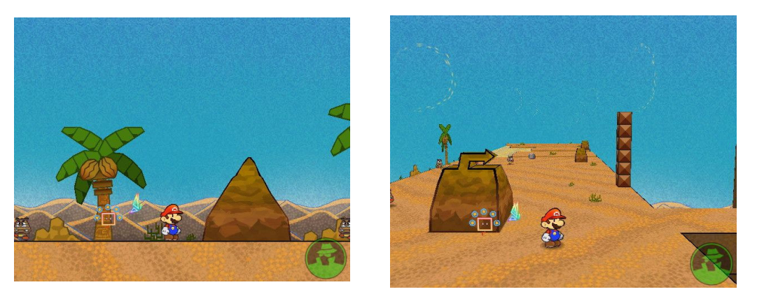
Figure 4: the same place in 2D and 3D, the latter revealing a hidden path.

cases – including the beginning of the game – the game is two-dimensional, but early in the game Mario learns how to switch to a three-dimensional environment. Whenever the player gets in a situation that seems unconquerable, she can choose to go into 3D, which will often provide a solution.<sup>53</sup> Also when the situation is not hopeless, the 3D mode can be chosen to explore more possibilities, and search e.g. for extra coins. It is a funny and initially a somewhat odd experience that Mario apparently has two ways of being. The two modes do not necessarily form a unity; that is, in 2D you know that the elements you see will at least also appear in 3D, but whether they appear on the left or the right within the 3D mode is unpredictable. It can happen that in 2D you stand on a floating platform, while you fall of that platform as soon as you flip into 3D.